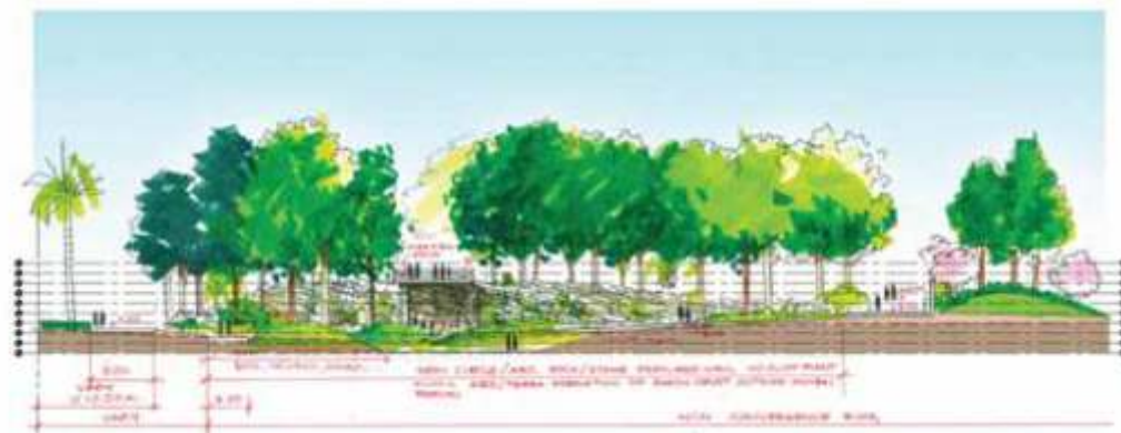
"Township Greens sketch by L49"

Kalpataru Parkcity is a mission to create an international lifestyle in the centre of Thane. Our global partners have ensured that by planning every facet of life within the township – from the flow of traffic on the roads to the features of the township to the basic needs of life here. Within phases too, you will find the same attention to detail. Towers have been mapped so that there is space between them and the boundary walls for security. The space between each tower has been optimised for privacy, and is yet not so much that one feels isolated.