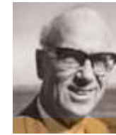
SIR OVE ARUP

Past Projects: Whizzdom Connect in Bangkok, Unixx and The River in Bangkok, amongst many others.